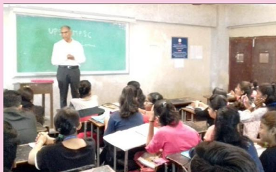
Commerce Department has started the Competitive exam MPSC/UPSC guidance lectures for all the F.Y/S.Y/T.Y.B.Com students.