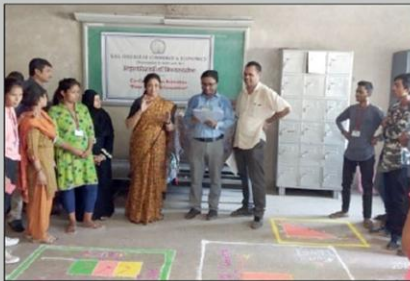
Rangoli Competition by Economics department on 3rd October, 2018