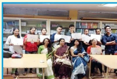
Distribution of the certificates of a course in Tours and travels Tourism 08/08/2018