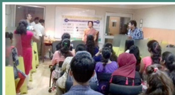
Commerce Department of our college ,with collaboration of IT Genius Computer Institute, Mumbai has been started Short term Certificate Course of Computer form 1st February 2019 in the college. The course is mainly focused on TALLY and GST Certificate along with DTP which is going to provide the employment opportunities to the students after completed the course.