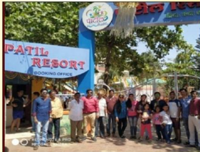
Staff Picnic at Patil Resort, Virar