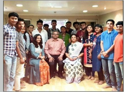
Computer Basics Course by Mathematics Department