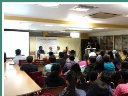
IQAC Seminar One Day Multidisciplinary National Seminar On "Paradigm Shifts in Commerce, Management & Economics: Towards Sustainable Growth of India" was held on Saturday ,9th February 2019 organized by Internal Quality Assurance Cell (IQAC) of N.S.S. College of Commerce and Economics, Tardeo-Mumbai 34.