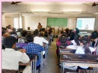
A Guidance lecture on, “Career Options in Commerce”