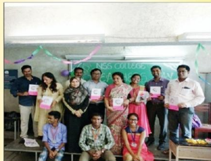
Teachers Day Celebration on 07/09/2018