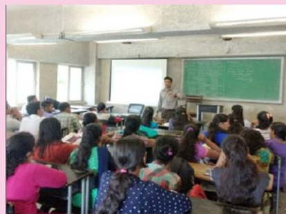
Edubridge Training Program arranged by Career Counseling Cell