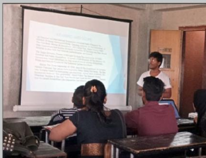
Best out of Waste competition conducted by EVS dept.on 29th September 2018.