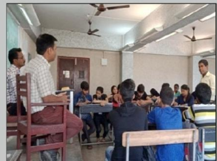
Computer Basics Course by Mathematics Department