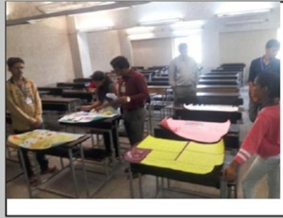
EVS department has conducted poster competition on 'impacts of ganapati immersion ' on 28th September 2018.