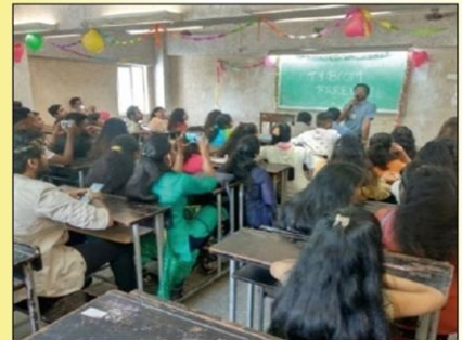
Send of party for T.Y.B.Com