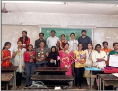
Best out of Waste competition conducted by EVS dept.on 29th September 2018.