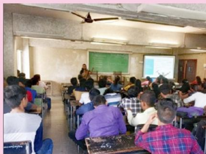
Workshop on Employment Skill arranged by Career Counseling Cell