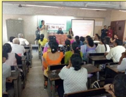
Meeting with Parents on 27/10/2018