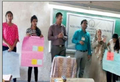
Poster Competition on 04th October, 2018 by Economics department