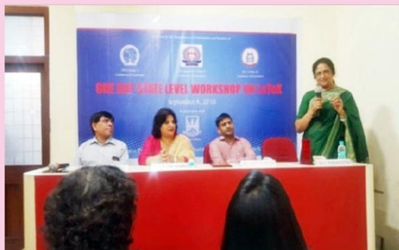
One day state level workshop on LaTeX on 8th September 2018. Organized by Mathematics department