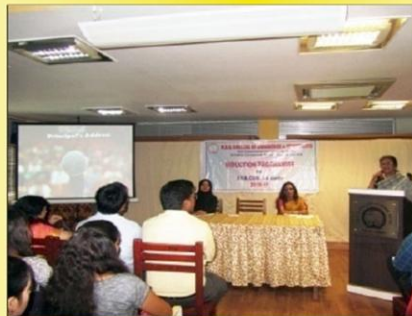
Orientation programme for F.Y.B. Com. on 26th July 2018