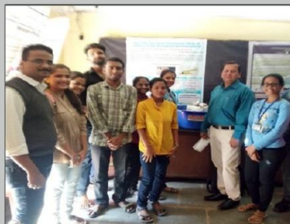
EVS department has conducted poster competition on 'impacts of ganapati immersion ' on 28th September 2018.