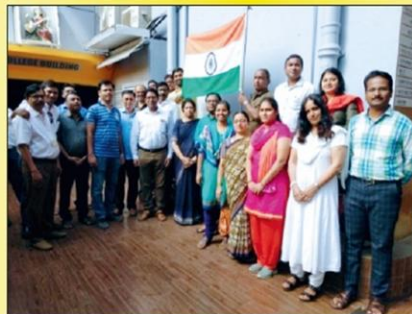
1st May Maharashtra Divas 2019